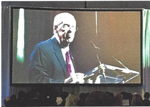
Senator Johnny Isakson addresses crowd